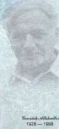
Genrich Altshuller 1926 — 1998